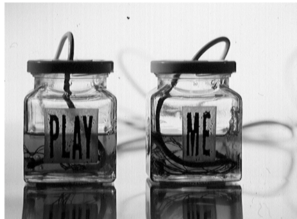
Fig 1. The Piano Cubes

The process for each of these projects was to design a simple physical interface using very basic electronic components (tilt switches, linear potentiometers etc) and then design some kind of musical or sound interaction to work with this interface. Technical details can be found at the end of this paper.